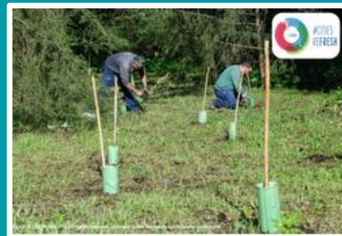
Breathing LIFE into Lisbon through enhanced urban green infrastructure