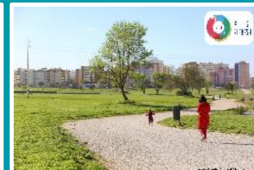
Várzea Urban Park: An innovative climate adaptation project in the heart of Setúbal