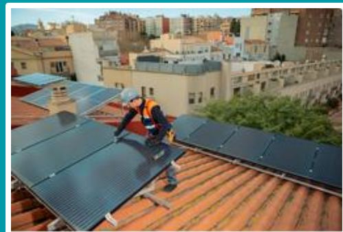
Valencia Province empowers municipal action to accelerate solar deployment and promote change locally