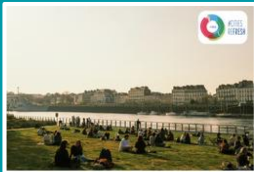
Nantes: Survey on Residents' Vulnerability for Tailor-Made Solutions to Extreme Heat