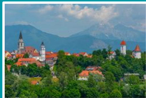
Regional coordination for better SECAP development in Gorenjska, Slovenia