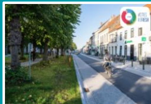
Nature-Based Solutions for Cooling Ghent