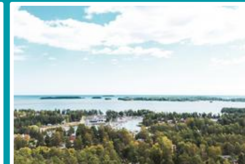
Waste heat for district heating in Espoo