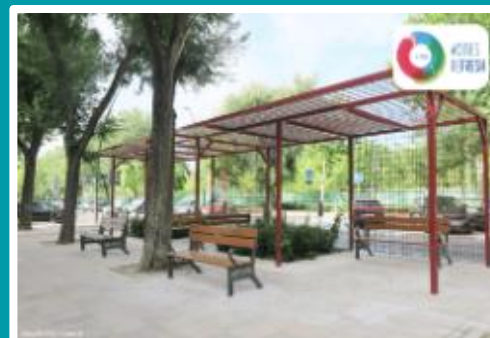
Getafe's innovative approach for addressing energy poverty and heatwaves