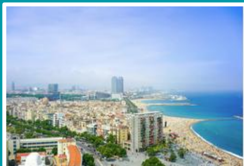
Citizens' Climate Assembly in Barcelona