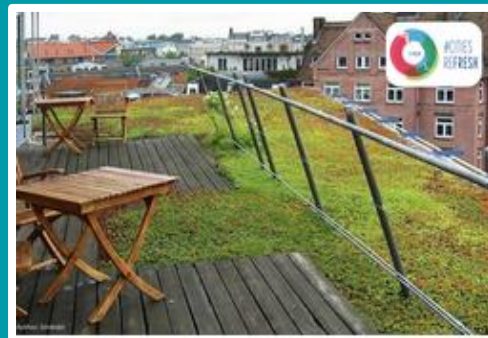
Four pillars to Hamburg's Green Roof Strategy: financial incentive, dialogue, regulation, and science